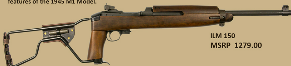
ILM 150 MSRP 1279.00

The M1A1 is modeled after a late production 1944 M1A1 Paratrooper model with a folding "low wood" walnut stock, Type 2 barrel band, and includes the same style adjustable sights which were actually introduced in 1944. The M1A1 includes a 15 round magazine and offers the same common features of the 1945 M1 Model.