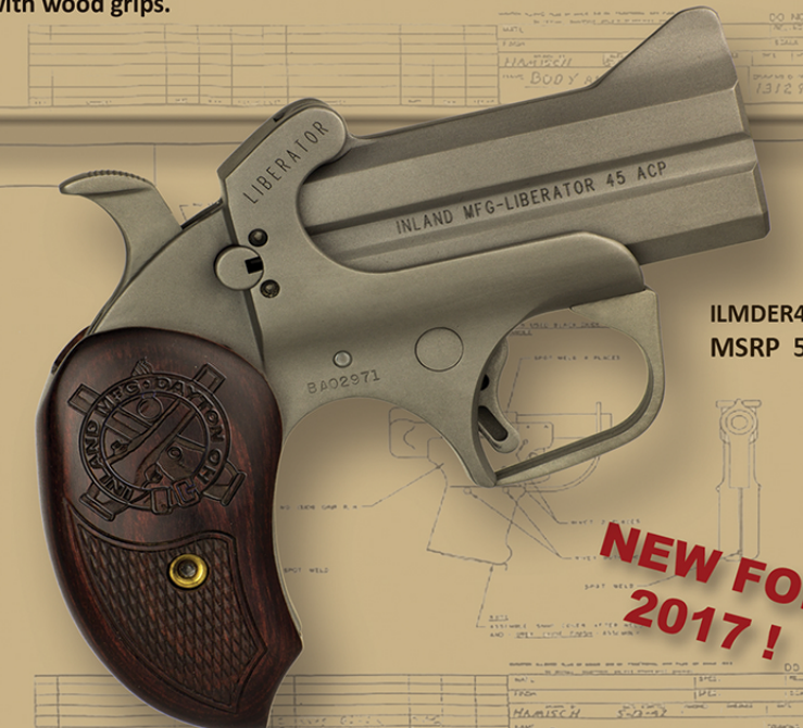
ILMDER45 MSRP 559.00

In the spirit of the FP-45 Liberator pistol developed by Inland Division of General Motors during WWII, we are proud to offer our version of the Inland Liberator 45. Inland has partnered with Bond Arms to produce the new Inland Liberator 45 derringer chambered in .45 ACP with 3" double barrels. The Liberator 45 has a bead-blasted anti-glare finish with wood grips.