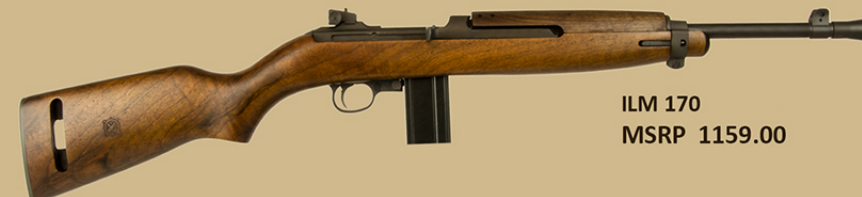
ILM 170 MSRP 1159.00

The new Inland M1 "Jungle Carbine" is modeled after the 1944 M1 carbine featuring a "Type 2" barrel band. Since "Jungle Rules" apply, there are no rules! This handy little carbine features a 16" (1/2" x 28 tpi) threaded barrel with a conical flash hider giving it a very familiar profile of other jungle carbines. The Jungle Carbine features adjustable rear sights, push button safety, round bolt, "low wood" walnut stock, and a 15 round magazine. A 30 rd mag catch was utilized to allow high capacity magazines.