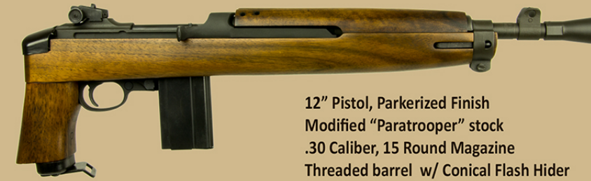
12" Pistol, Parkerized Finish Modified "Paratrooper" stock .30 Caliber, 15 Round Magazine Threaded barrel w/ Conical Flash Hider

The "Advisor" M1 pistol is modeled after the modified M1 carbine that was a popular conversion made by US Military Advisors during the Vietnam Era. These Military Advisors found that the compact and reliable M1 carbine could be made even more suitable for their specific missions by cutting the barrels down to pistol lengths and utilizing either a cut down standard stock or the M1A1 folding stock.