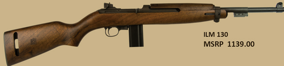
ILM 130 MSRP 1139.00

The new Inland M1 carbines feature many of the same characteristics of the original Inland carbines and are manufactured in the USA! The 1945 version of the M1 carbine is modeled after the last production model that Inland manufactured and features a type 3 bayonet lug / barrel band, adjustable rear sights, push button safety, round bolt, "low wood" walnut stock, and a 15 round magazine. A 30 rd mag catch was utilized to allow high capacity magazines.