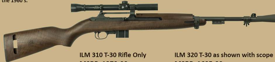
ILM 310 T-30 Rifle Only MSRP 1279.00

The T30 carbine is available with a vintage style M82G2 Sniper Scope by Hi-Lux. During WWII, one of the riflescopes chosen for the M1C Garand sniper rifle, as well as the Remington Model 1903A4 Springfield pattern bolt-action .30/06 sniper rifle, was the 7/8-inch tube 2.5x Lyman Alaskan, which was designated "TELESCOPE M82". Primarily the M82 was used to turn select rifles into very effective longer range (600 to 800 yards) sniper rifles. The M82 scopes were utilized in WW II and were called upon again for use during the Korean Conflict and in Vietnam during the 1960's.