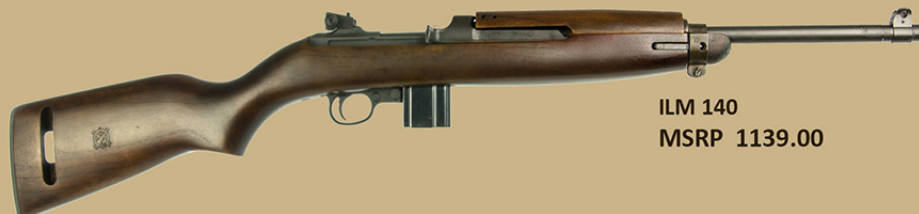
ILM 140 MSRP 1139.00

The 1944 M1 Carbine has the same features as the 1945, but with a Type 2 barrel band and 10 round magazine, it is available for sale in most states with magazine capacity and bayonet lug restrictions.