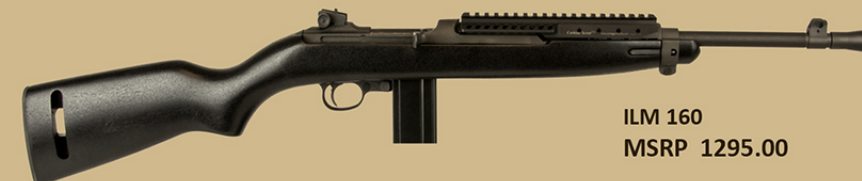
ILM 160 MSRP 1295.00

The new Inland M1 "Scout Carbine" is a modern variation of the new Jungle Carbine. This handy little carbine features a 16" (1/2" x 28 tpi) threaded barrel with a conical flash hider. The Scout Carbine features adjustable rear sights, push button safety, round bolt, "low wood" black textured stock, and a 15 round magazine. A 30 rd mag catch was utilized to allow high capacity magazines. The "Scout Carbine" is finished off with an aluminum tactical handguard with a machined picatinny rail for mounting optics or other accessories in a scout rifle configuration.