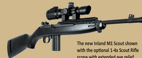
The new Inland M1 Scout shown with the optional 1-4x Scout Rifle scope with extended eye relief.

The new Inland M1 "Scout Carbine" is a modern variation of the new Jungle Carbine. This handy little carbine features a 16" (1/2" x 28 tpi) threaded barrel with a conical flash hider. The Scout Carbine features adjustable rear sights, push button safety, round bolt, "low wood" black textured stock, and a 15 round magazine. A 30 rd mag catch was utilized to allow high capacity magazines. The "Scout Carbine" is finished off with an aluminum tactical handguard with a machined picatinny rail for mounting optics or other accessories in a scout rifle configuration.